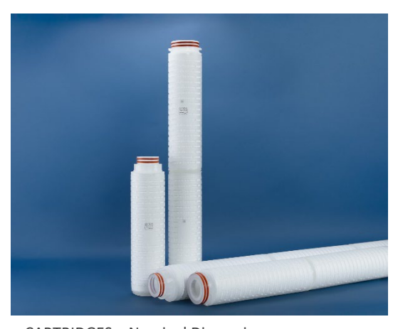
CARTRIDGES – Nominal Dimensions Length: 5 to 40 in. (12.7 to 101.6 cm) Outside Diameter: 2.75 in. (7.0 cm)